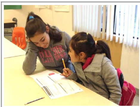
- Lochburn Middle School Volunteers at Oakwood Elementary